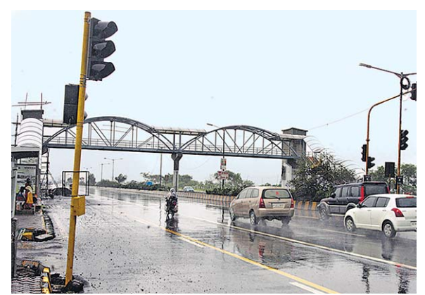
Many foot over bridges like this one on the Eastern Express Highway at Kanjurmarg will appear in the city